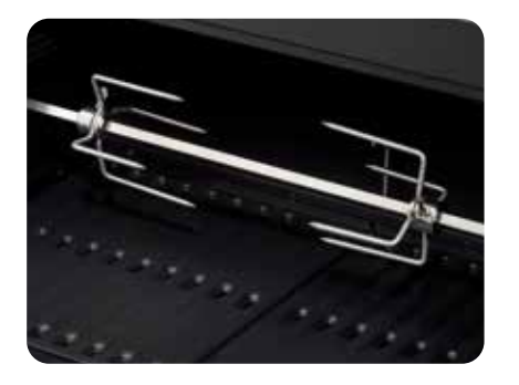
TCEAC-004 Rotisserie kit