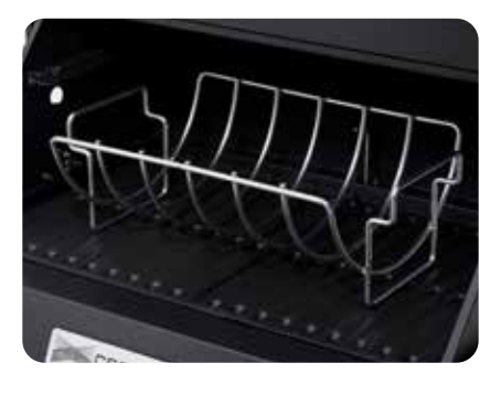
TCEAC-005 Roasting rack