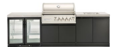
TC4K-10 Double side cabinets with 1x flat bench top, under bench sink and double fridge

Wanting to get the most out of your outdoor space? CROSSRAY offers space-saving BBQ solutions for the avid griller. Entertaining is now possible for everyone, regardless of space.