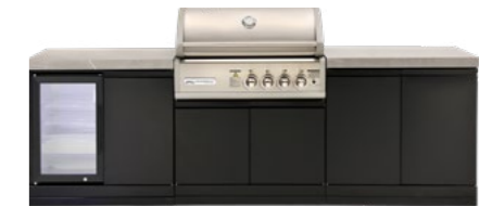
TC4K-07 Double side cabinets with flat bench tops and single fridge