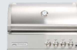
4 Burner In-built BBQ Model: TCS4FL