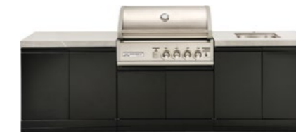
TC4K-06 Double side cabinets with 1x flat bench top and under bench sink