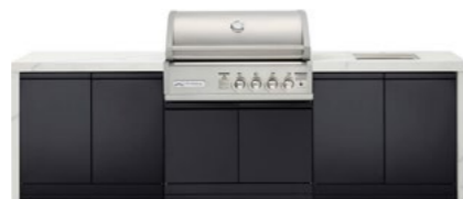
TC4KP-12 (White) | TC4KB-18 (Black) Double side cabinets with 1x flat bench top and under bench sink