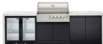
TC4KP-15 (White) | TC4KB-21 (Black) Double side cabinets with flat bench tops and double fridge