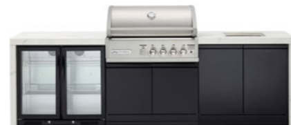
TC4KP-16 (White) | TC4KB-22 (Black) Double side cabinets with 1x flat bench top, under bench sink and double fridge