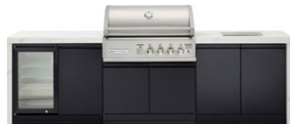
TC4KP-14 (White) | TC4KB-20 (Black) Double side cabinets with 1x flat bench top, under bench sink and single fridge