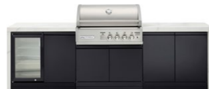
TC4KP-13 (White) | TC4KB-19 (Black) Double side cabinets with flat bench tops and single fridge