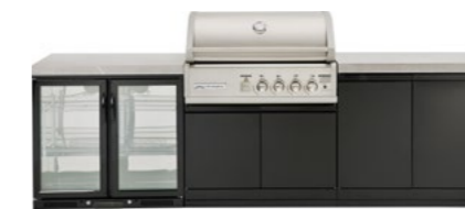
TC4K-09 Double side cabinets with flat bench tops and double fridge