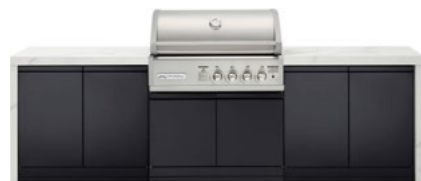
TC4KP-11 (White) | TC4KB-17 (Black) Double side cabinets with flat bench tops