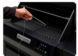
Meat probe included to set the preferred cooking temperature