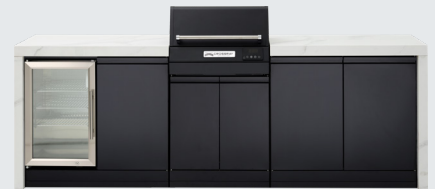
TCEK-03 Double side cabinets with flat bench tops and single fridge