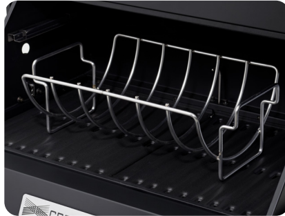
TCEAC-005 Roasting rack