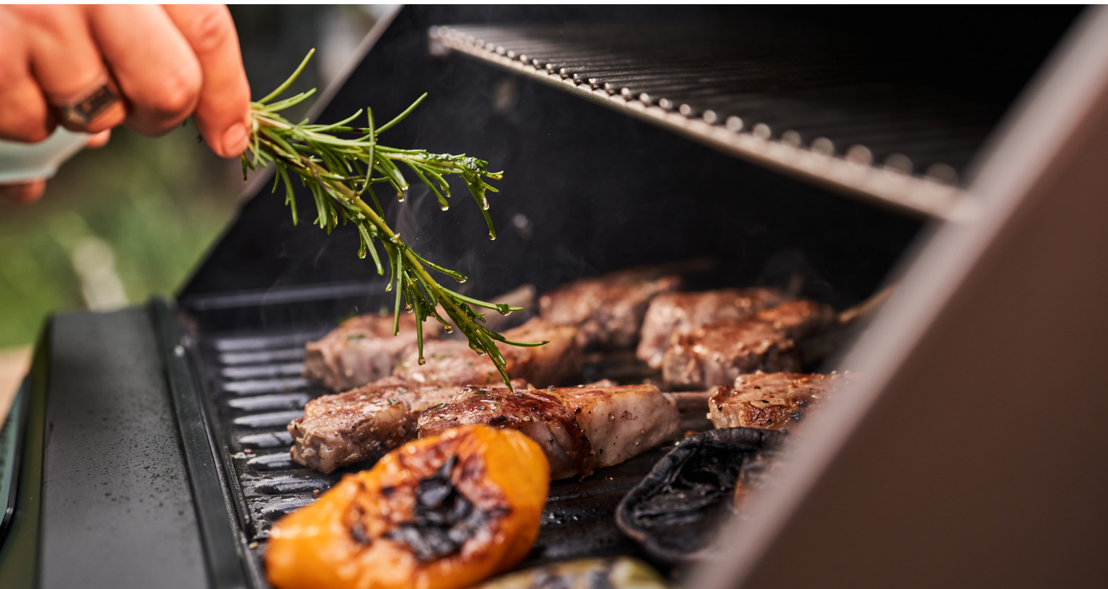
TCEAC-008 Trolley cover, also available