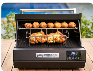
High hood design, includes warming rack