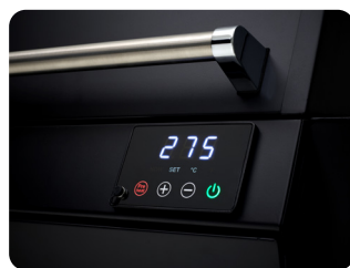
Digital, programmable control panel