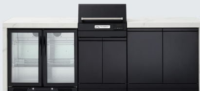
TCEK-05 Double side cabinets with flat bench tops and double fridge