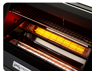
2x 1100W carbon-fibre infrared elements