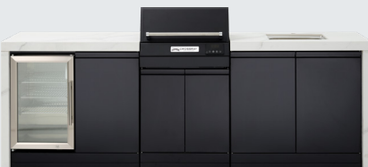
TCEK-04 Double side cabinets with 1x flat bench top, under bench sink and single fridge