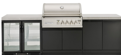
TC4K-09 Double side cabinets with flat bench tops and double fridge