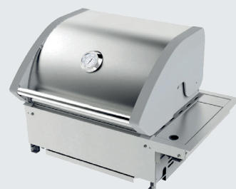
2 Burner Drop In BBQ