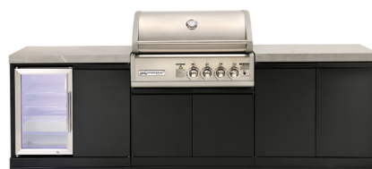
TC4K-07 Double side cabinets with flat bench tops and single fridge