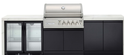
TC4KP-15 Double side cabinets with flat bench tops and double fridge