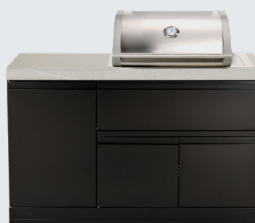
TC2K-MK1 Four door cabinet with flat bench top

All components of the CROSSRAY Outdoor Kitchens are also available to purchase individually. This includes the the BBQ and side cabinets, flat bench top, under bench sink top, single and double fridge. Please refer to the CROSSRAY website for more information www.crossray.co.nz