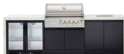
TC4KP-16 Double side cabinets with 1x flat bench top, under bench sink and double fridge