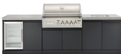
TC4K-08 Double side cabinets with 1x flat bench top, under bench sink and single fridge