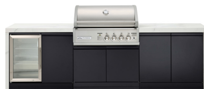
TC4KP-13 Double side cabinets with flat bench tops and single fridge