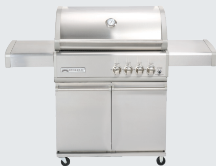
4 Burner Trolley BBQ

All CROSSRAY BBQ's come with grill plates as standard