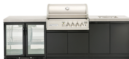
TC4K-10 Double side cabinets with 1x flat bench top, under bench sink and double fridge