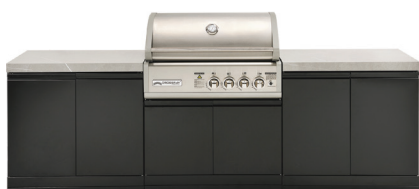
TC4K-05 Double side cabinets with flat bench tops