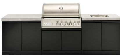
TC4K-06 Double side cabinets with 1x flat bench top and under bench sink