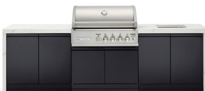
TC4KP-012 Double side cabinets with 1x flat bench top and under bench sink