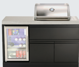
TC2K-MK1 Triple door side cabinet with flat bench top and single fridge

Introducing the new 2 Burner Mini Kitchen with flame failure device. This high end kitchen is designed with corrosion resistant cabinets and a fold down top shelf. The sintered stone bench-top that is supplied, comes standard with all kitchens.