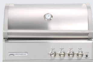
4 Burner In-built BBQ